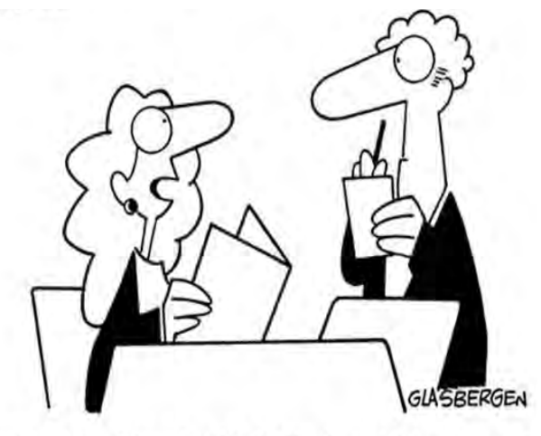
"I'm going to order a broiled skinless chicken breast, but I want you to bring me lasagna and garlic bread by mistake."