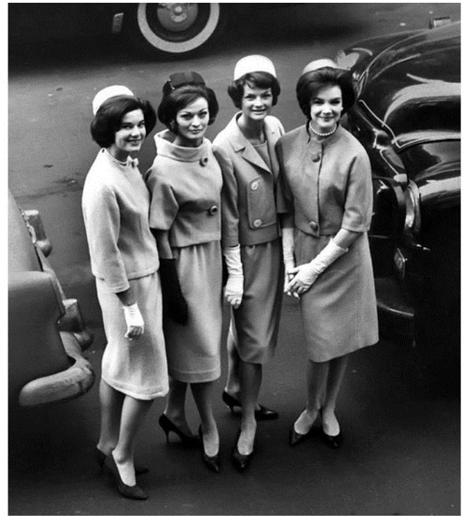
The "Jackie" look – 1961