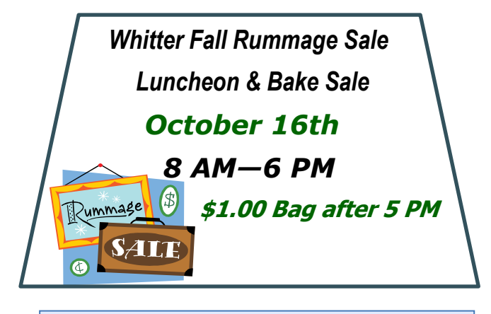
A Tribute to the Diet we are Always On.