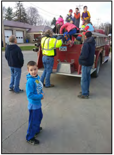
Rides on the fire trucks!