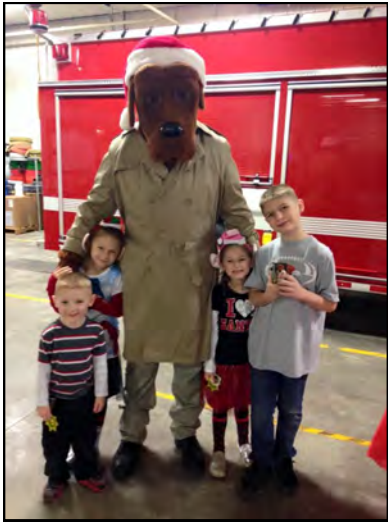
McGruff stopped by to take some pictures and sign some autographs!