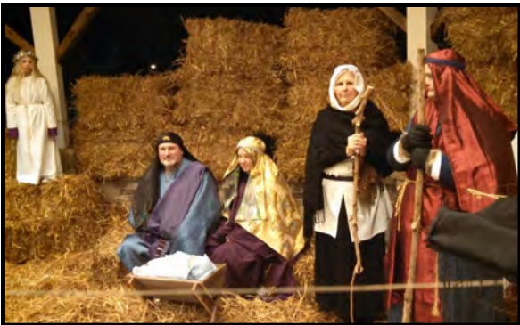
There was a live nativity scene at the Gazebo in Upper Butler Park. The Springville United Methodist Church hosted this event.