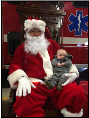
Santa is always a big hit with the kids. Thanks for sharing your kids with us!