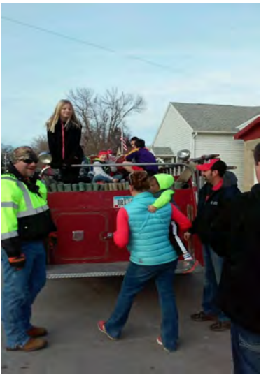
Rides on the fire trucks!