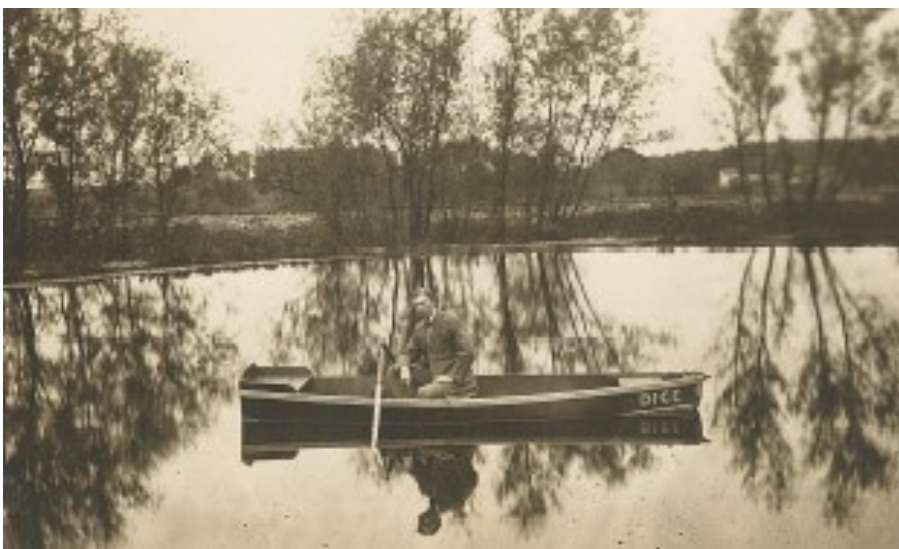
Carl Burroughs in a rowboat on the Springville pond, once called Crystal Lake. In background are railroad tracks. Date of photo is unknown. In June 1911, Burroughs contracted polio and lost the use of his legs, but with help could still get into a boat. See article on Page 2.